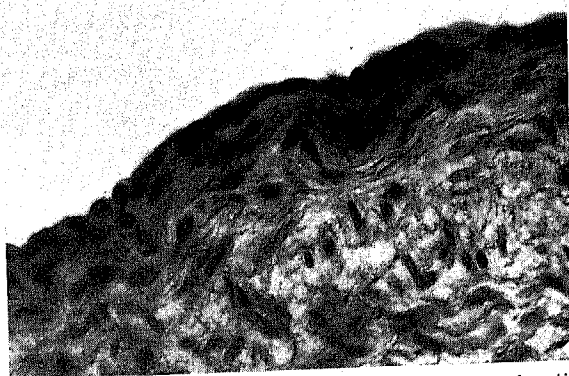
Fig. 1.—High power view of an early atherosclerotic lesion in a scorbutic guinea-pig. The dark internal elastic membrane and adjacent intima represents stained lipid (Scharlach R).

The earliest lesions were characterized by a diffuse deposit of stainable lipid along the internal elastic membrane and in the immediately adjacent intima. This staining faded out gradu-